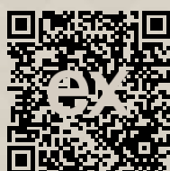
Link to property