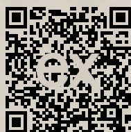
Link to property