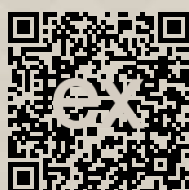
Link to property