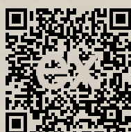
Link to property