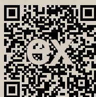
Link to property