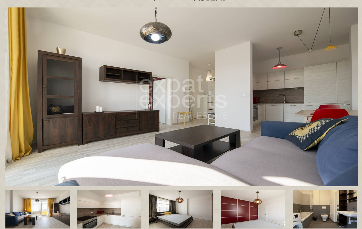
Sale One bedroom apartment, Jašíkova, Bratislava - Ružinov, Slovakia Bratislava II - Ružinov - Jašíkova - PRIMA PARK