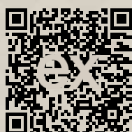
Link to property