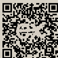
Link to property