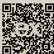
Link to property