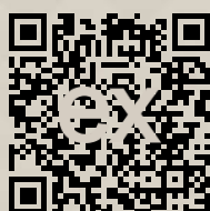
Link to property