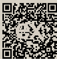
Link to property