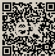
Link to property