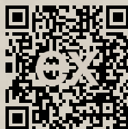
Link to property