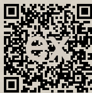
Link to property