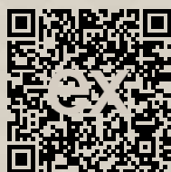
Link to property