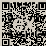
Link to property