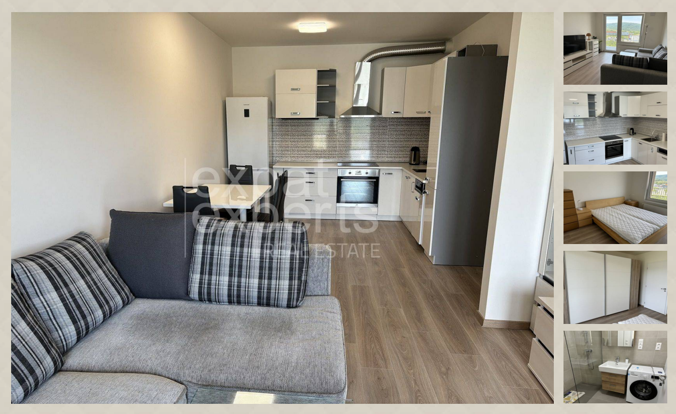
Interesting 1bdr apt 51m<sup>2</sup>, with parking and loggia, BORY Bratislava IV - Lamač - Dominka Tatarku - BORY