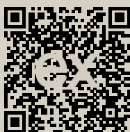
Link to property