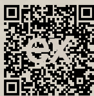
Link to property