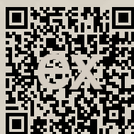
Link to property