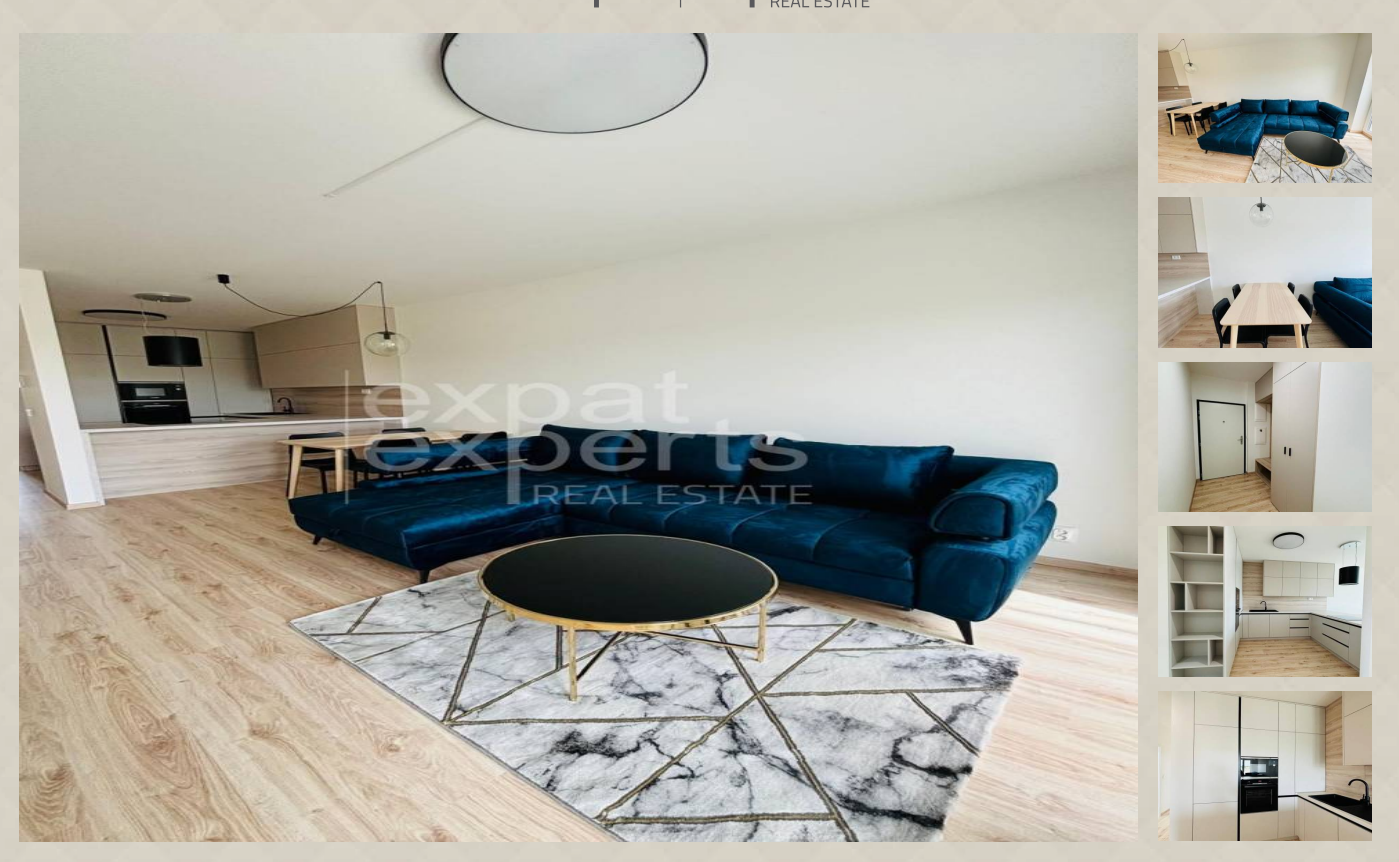
Beautiful 2bdr apt 77 m<sup>2</sup>, loggia, balcony, parking, SLNEČNICE Bratislava V - Petržalka - Labutia - SLNEČNICE