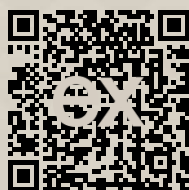
Link to property