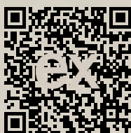
Link to property